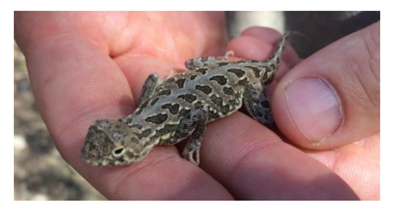
Figure 2. Plateau spot-tailed earless lizard.