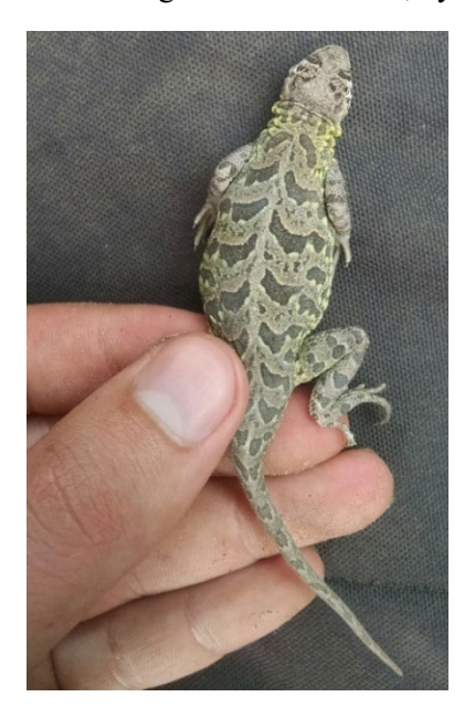
Figure 3. Tamaulipan spot-tailed earless lizard, likely a pregnant female.