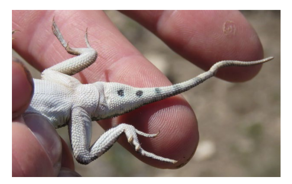
Figure 4. Tail spots on the underside of the tail of a plateau spot-tailed earless lizard.